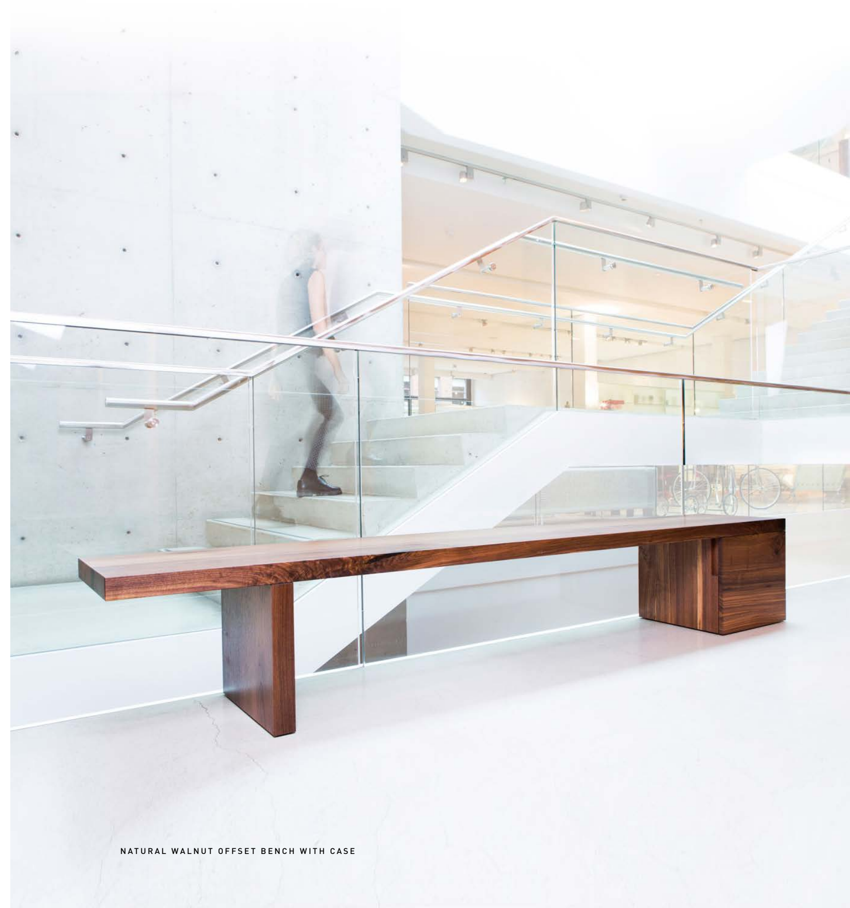
NATURAL WALNUT OFFSET BENCH WITH CASE